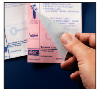
Original + 2 Copies