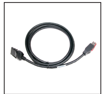
PoweredUSB Cable Included