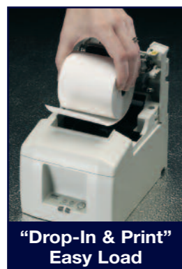
"Drop-In & Print" Easy Load