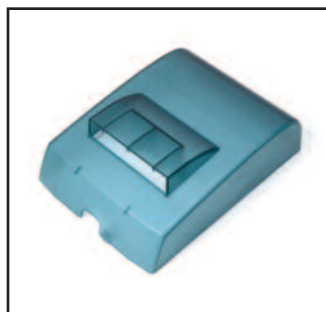
Splash Proof Cover