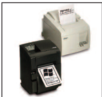
Gray or Putty