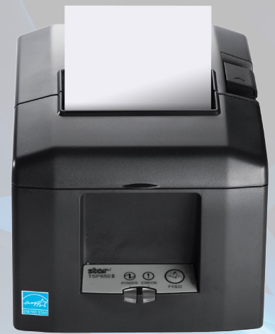
TSP650II BTi Printer

Castillo is a New York City restaurant, offering unique Ecuadorian cuisine with a twist of American, Italian, and South American spices and flavors. Established in Sunset Park fifteen years ago, Castillo is now famously known for their dishes inspired by different geographical locations in Ecuador, including the coast, the Andes Mountains, and the northern border between Ecuador and Columbia. Their authentic Ecuadorian cuisine has gained prevalence in many areas, presenting opportunities for them to acquire two more locations, one in Sunset Park and another in Park Slope.