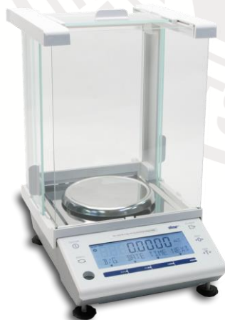
MG-S222,R thru MG-S1202,R