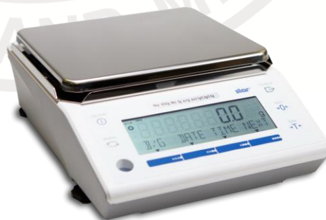
MG-S1501,R thru MG-S15000,R